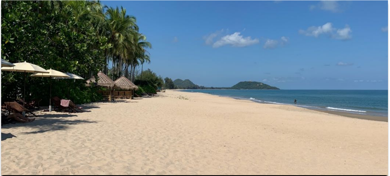
A dream beach for you alone