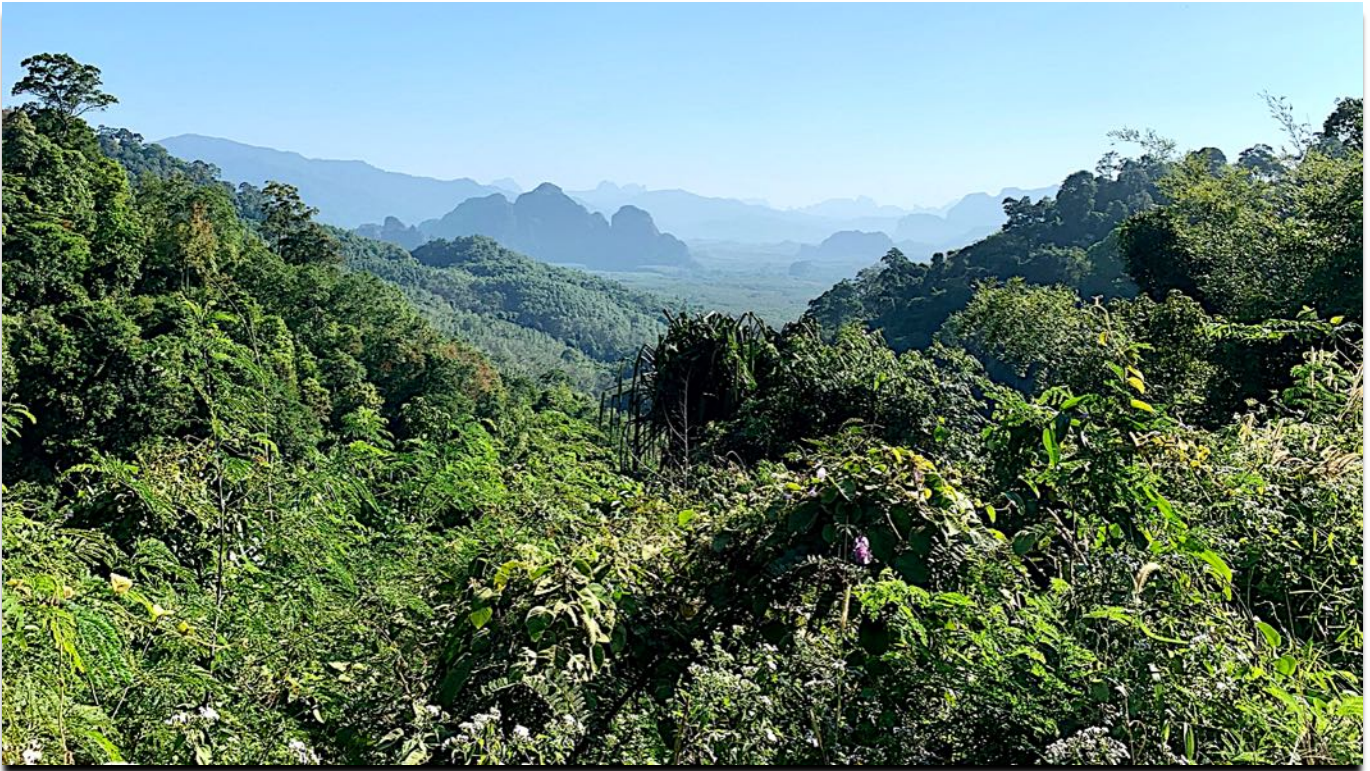
Stunning view over the limestone peaks of Khao Sok National Park on day 4