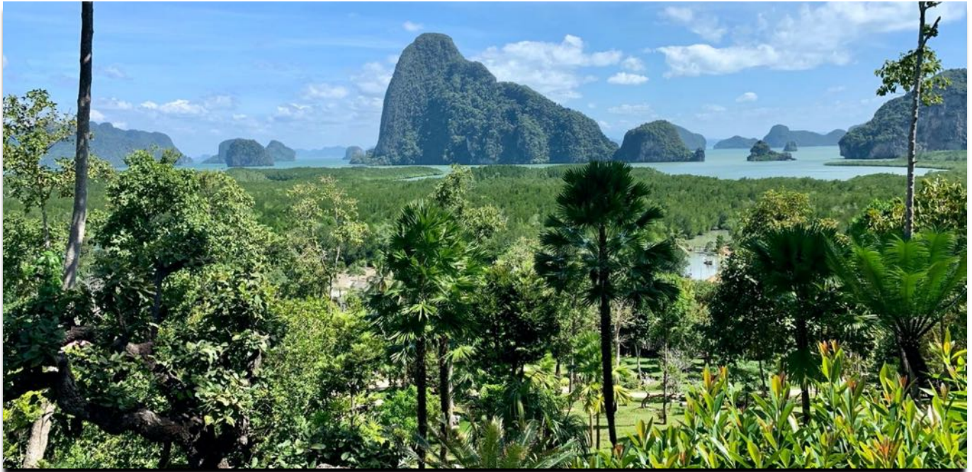
James Bond Island Phang Nga Bay on day 2