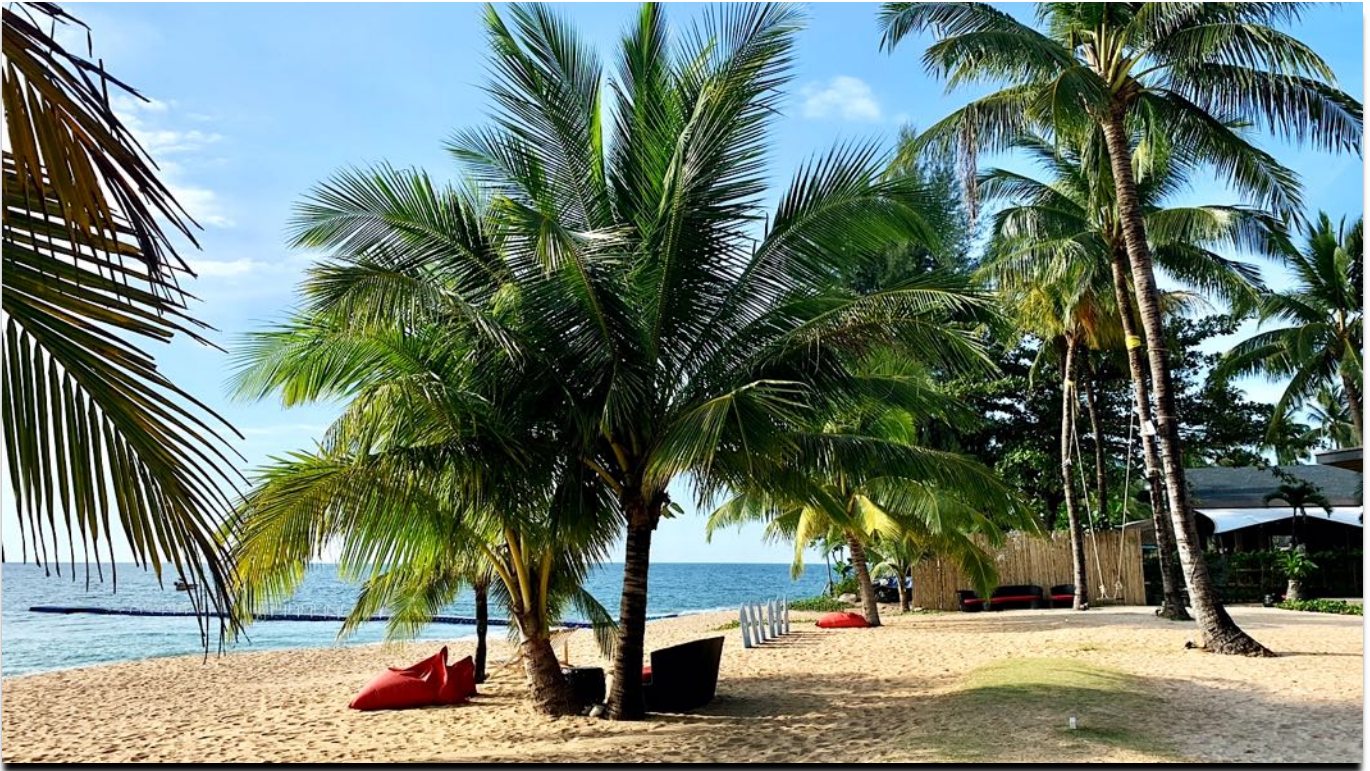
Relax on the beach in Khao Lak on day 4