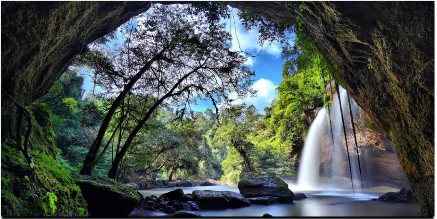
There are many waterfalls worth seeing in Khao Yai