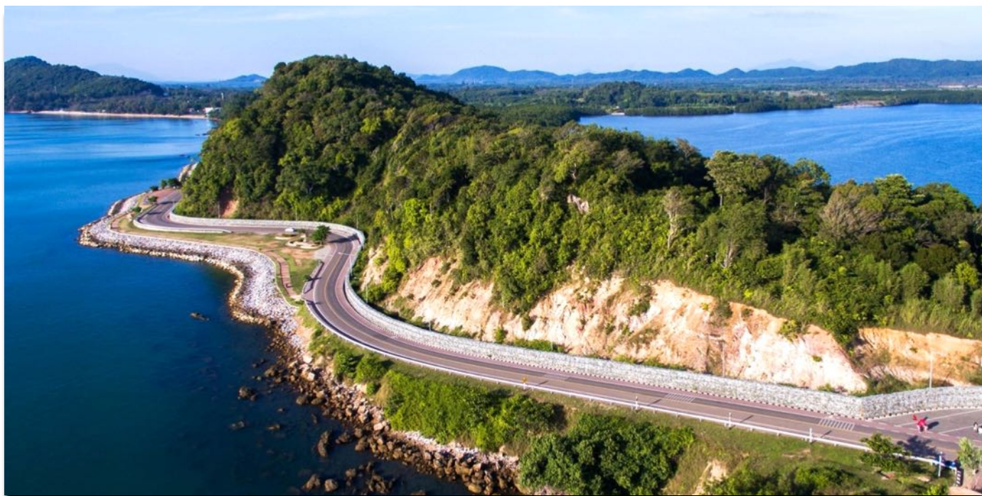
Noen Nang Phaya viewpoint in Chanthaburi province