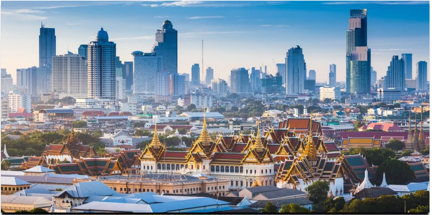
Bangkok the City of Angels - where history meets modernity