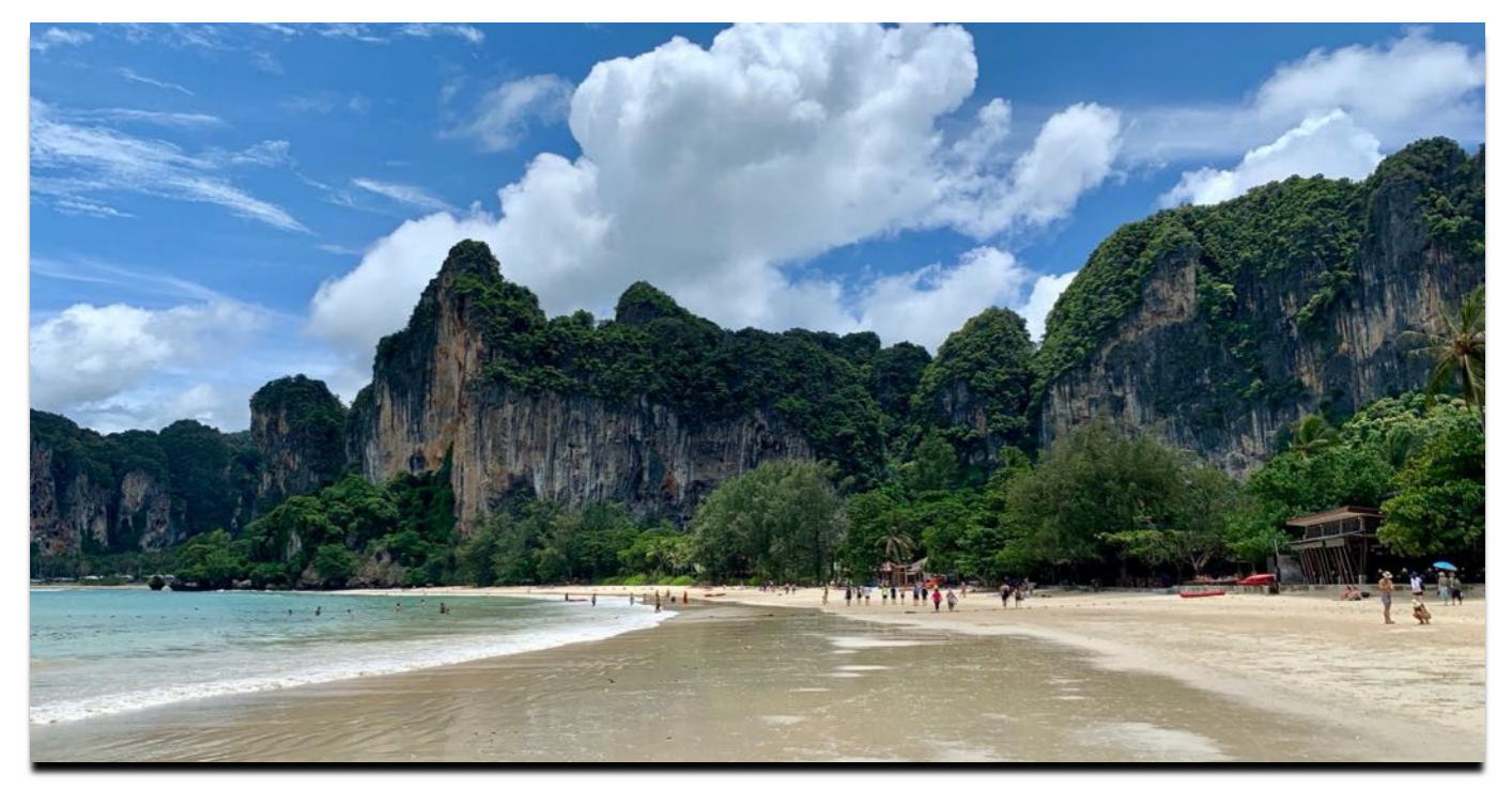
Railey Beach Krabi