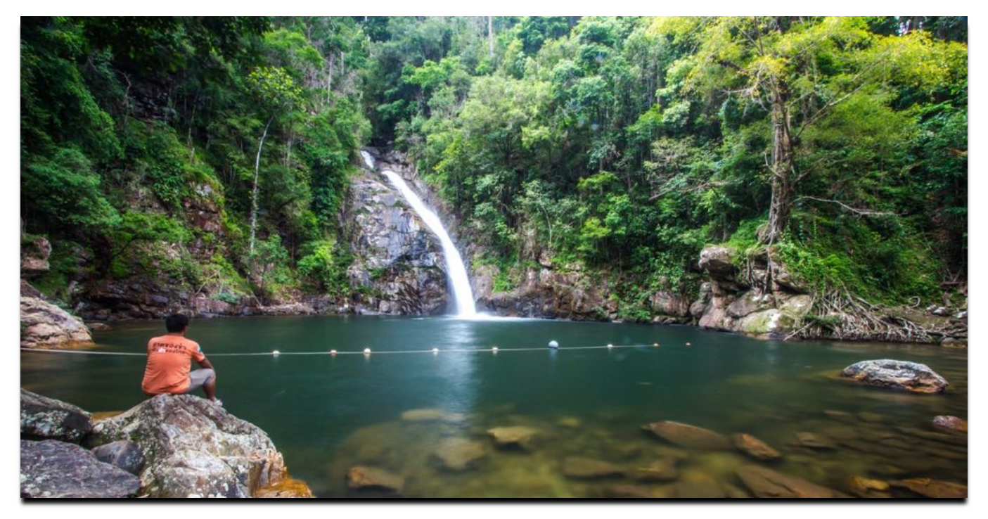
Yong Waterfall near Thung Song - Let's have a swim