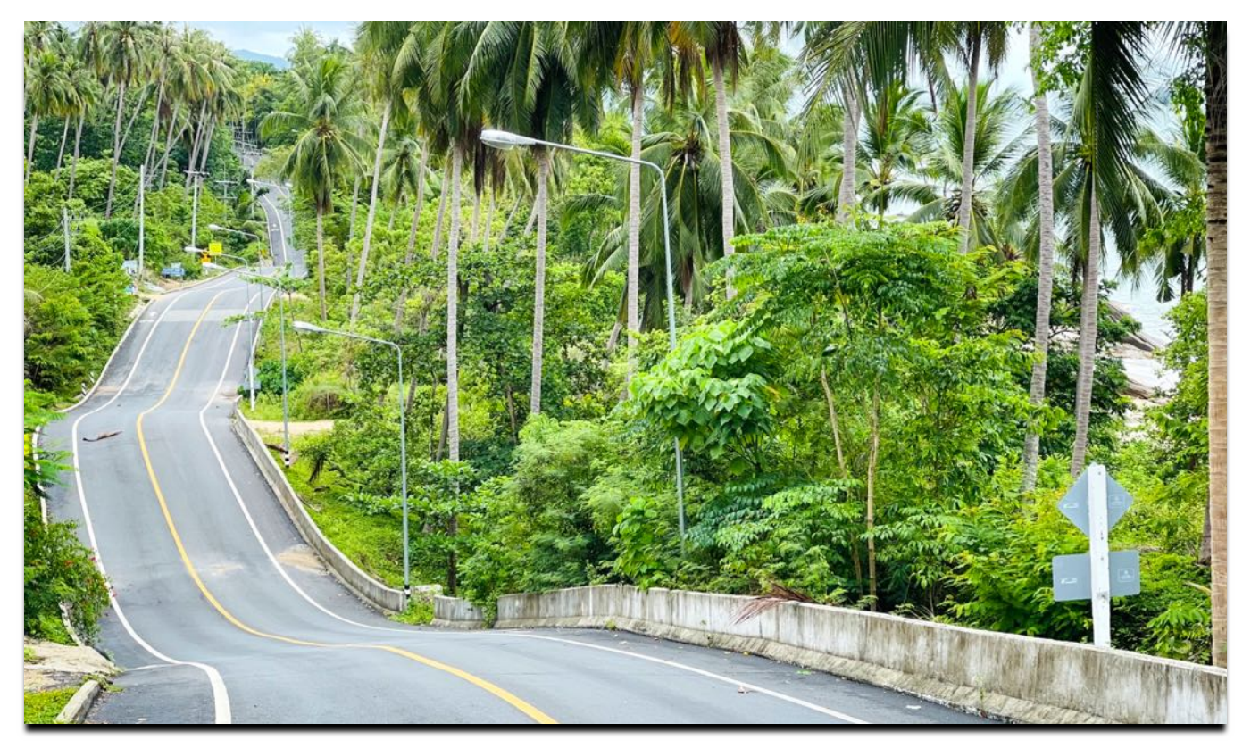
<Riviera of the South> Coastal road from Khanom to Sichon. Take a look on the rest day!