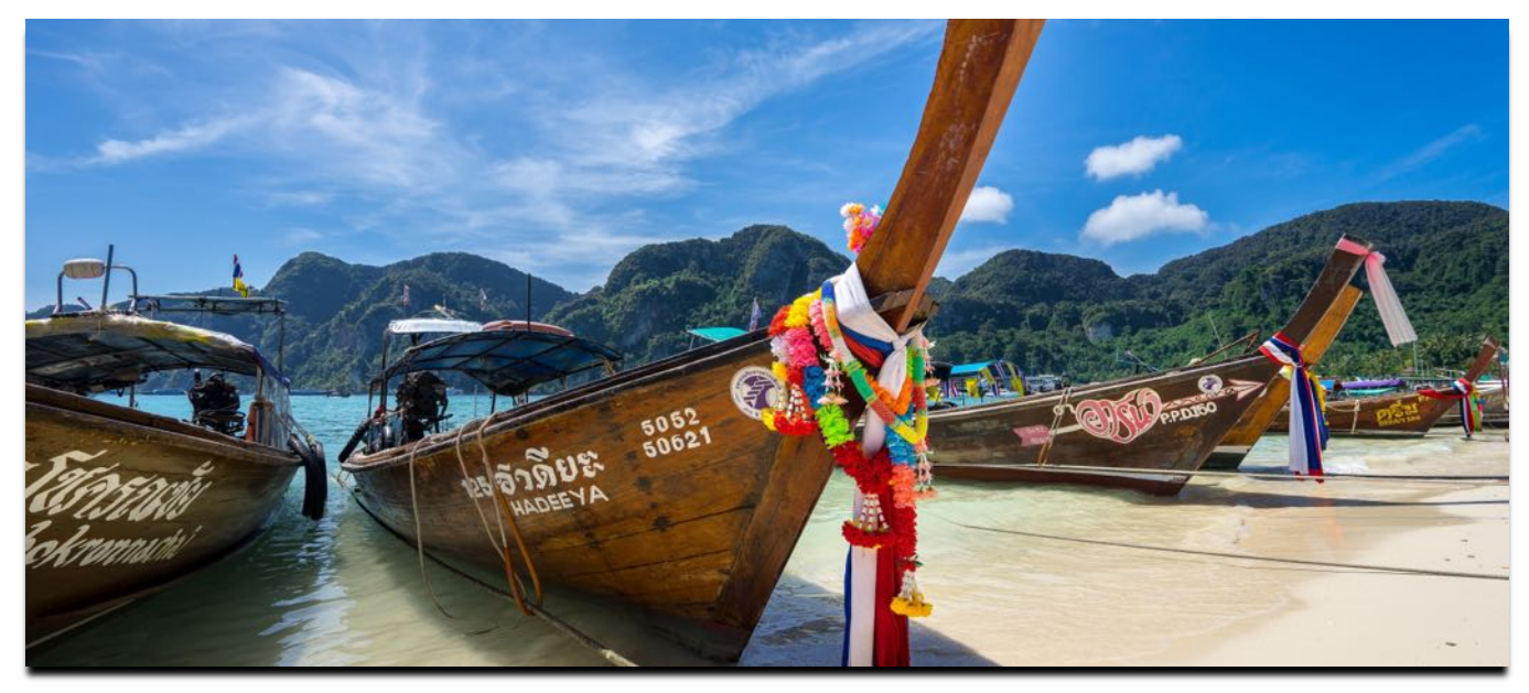
Krabi province provides countless beautiful dream beaches