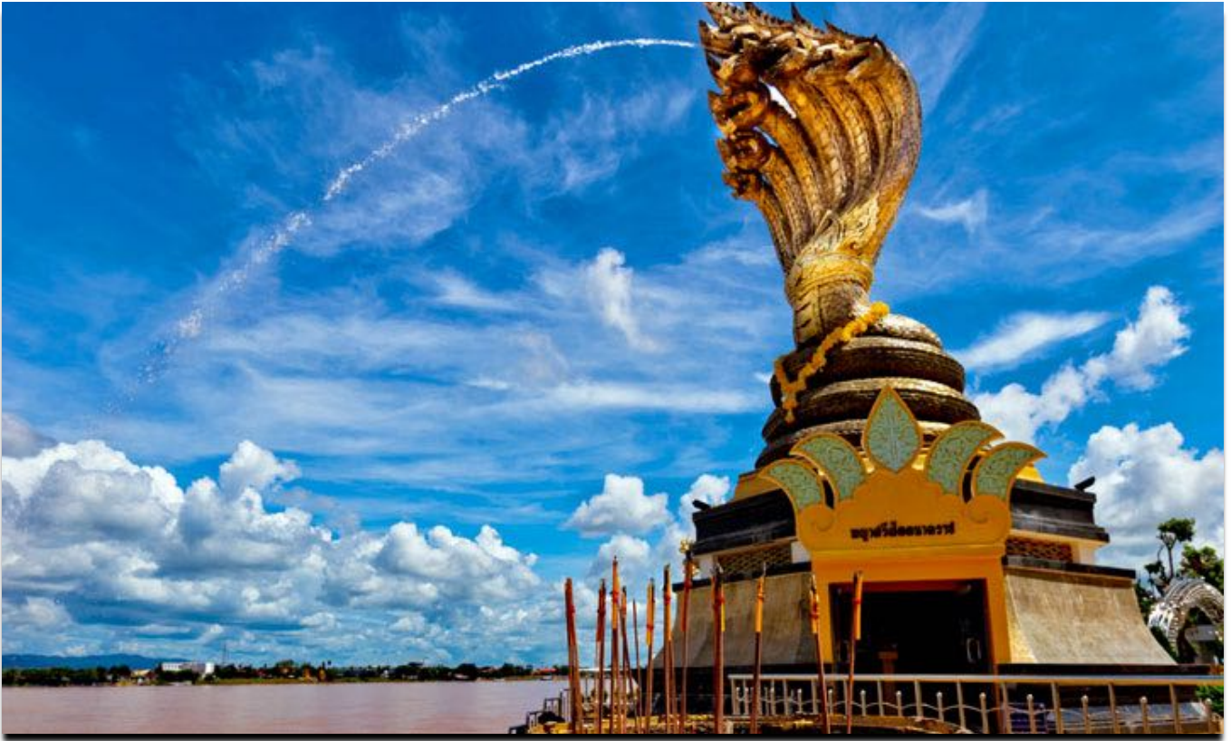
Passing many historical places and magnificent temples along the river