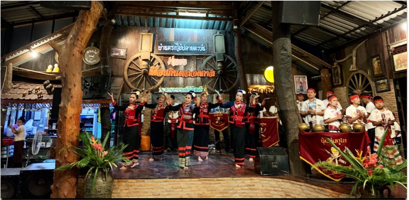
Meeting local artists at Ban Muang