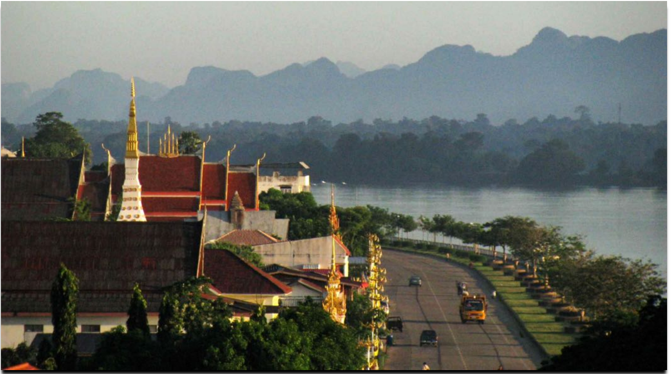
River view at Nakhon Phanom. The mountain range belongs to Laos