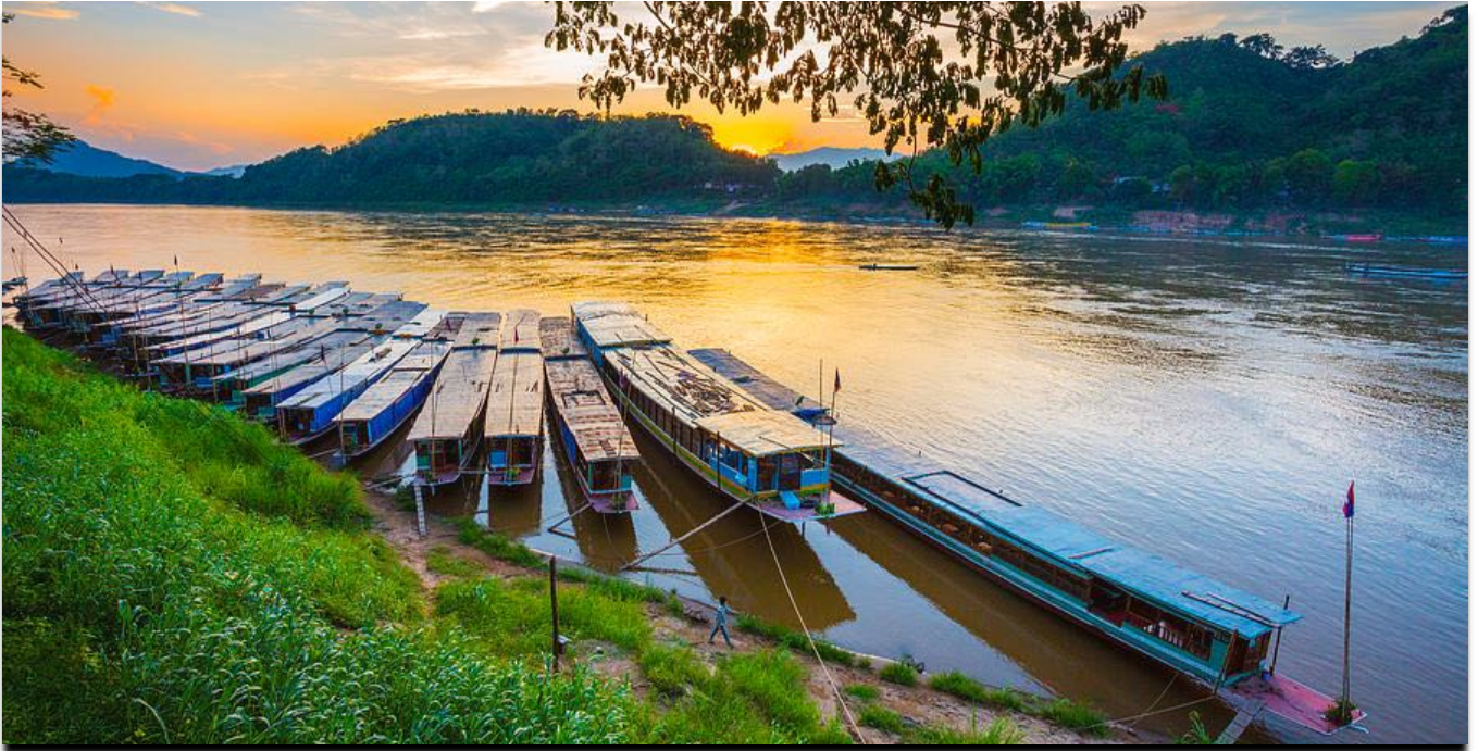
Experience stunning views of legendary Mekong River