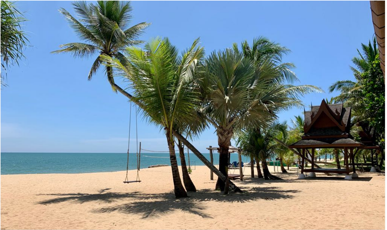
Relax on the beach in Khao Lak on day 9

Passing Thung Maprao, we pedal virtually traffic-free through rubber tree and palm forests with an impressive mountain backdrop. On perfect flat roads we arrive at Thai Muang Beach and have a refreshing coffee break. We follow the stunning coastal road back to Natai Beach. The tour ends after taking awesome pictures on majestic Natai pier . In the early afternoon we organize the transfer to your next destination (Not included). Holiday extensions could be arranged by us. ✂ B | L | D