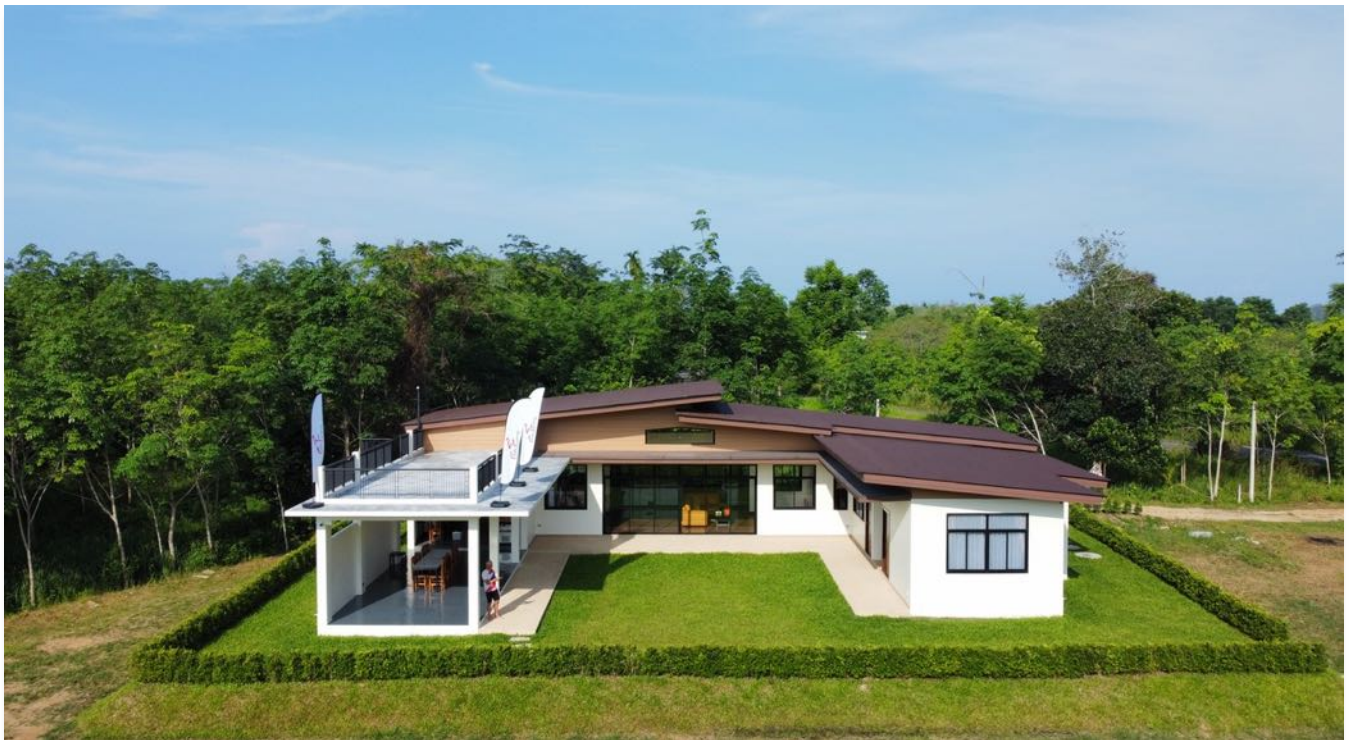
Chilli Cycling Terminal in Khok Kloi – Enjoy fresh beer and other chilling drinks