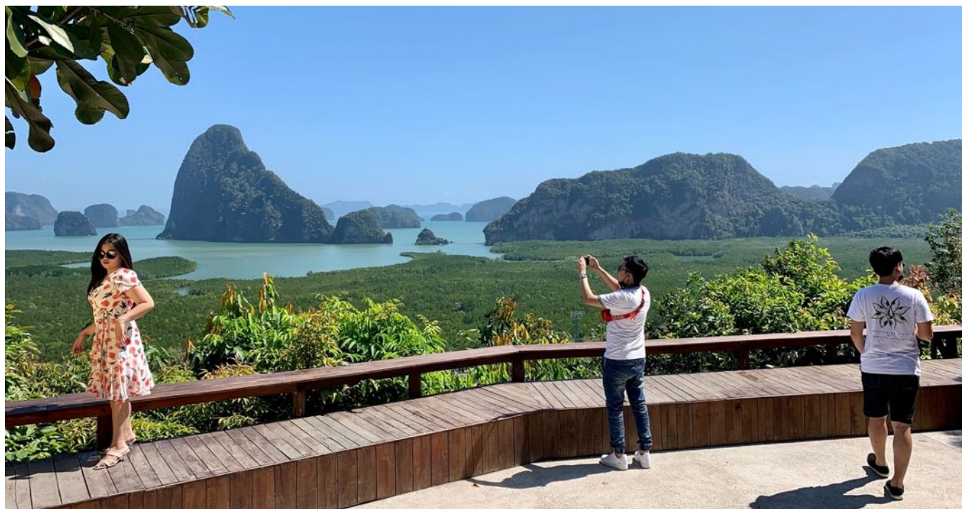
A must have seen – Samed Nangshe viewpoint Phang Nga Bay