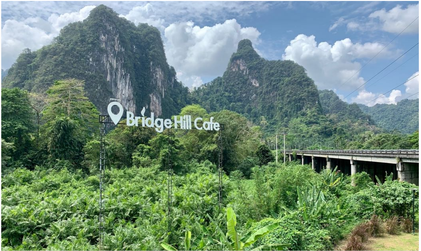
Stunning view over the limestone peaks of Khao Sok National Park on stage 6

We depart in the morning from our hotel in Khok Kloy. The road to Phang Nga leads through a lovely tropical landscape. In the afternoon we glide in longboats through a world of stony islets, overgrown with lush green vegetation. The Phang Nga Bay National Marine Park is renowned for its unspoiled mangrove forests and limestone karsts. You may recognise the rock formations from the James Bond film " The man with the golden Gun ", giving the trip its name as the "James Bond Island Tour". ✕ B | L