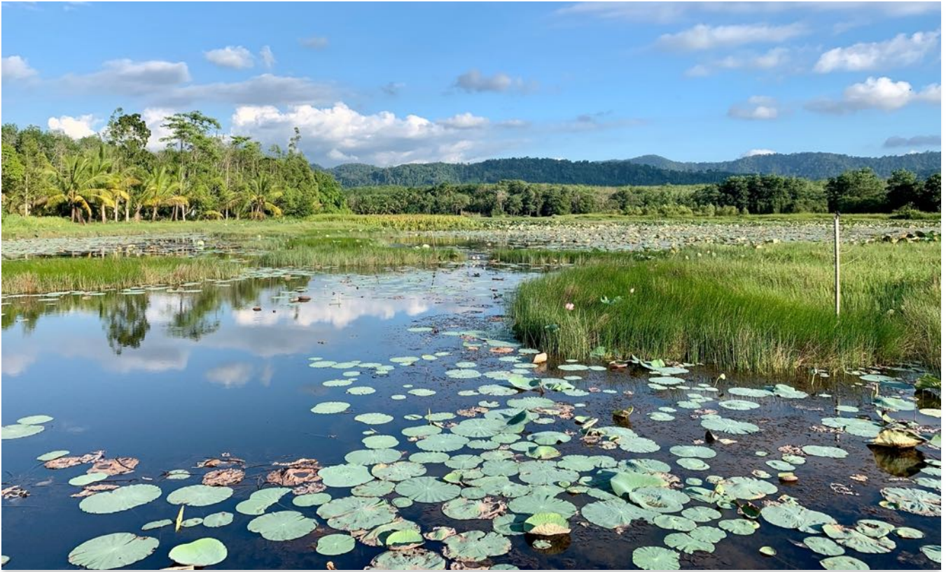
Khok Kloi, Phang Nga – a heaven on earth