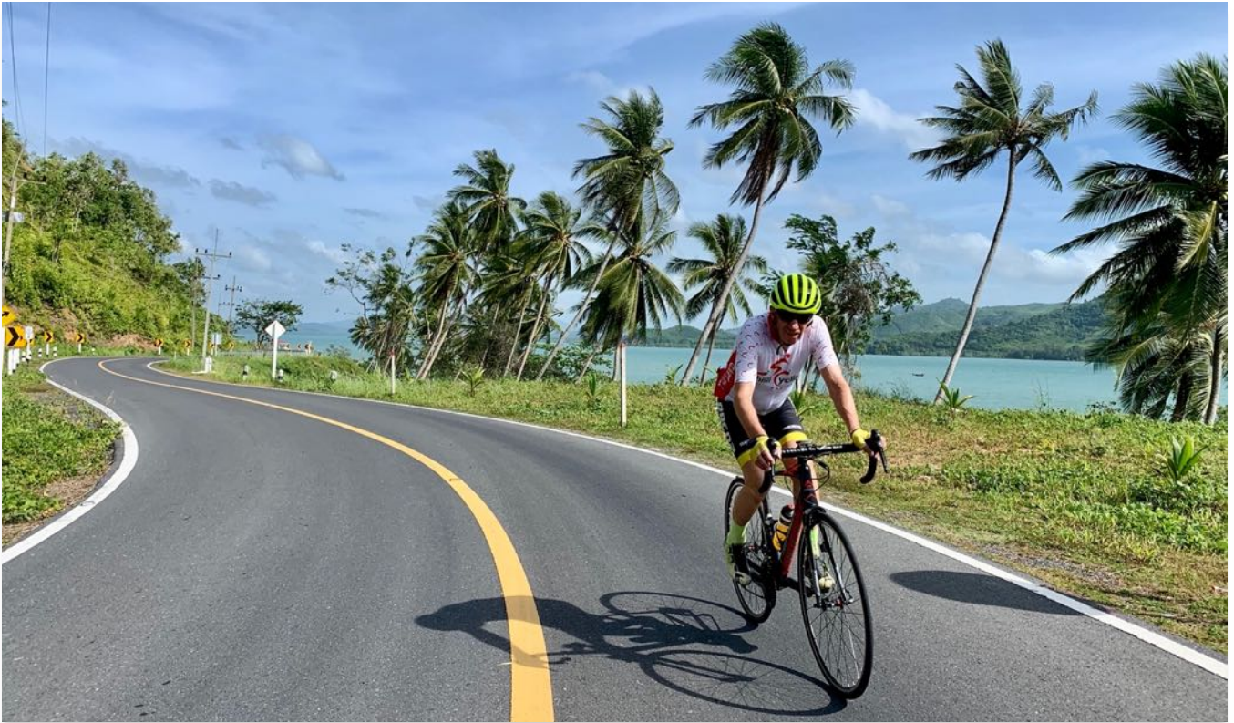
A trip to Laem Sai pier on Phuket Island on stage 2