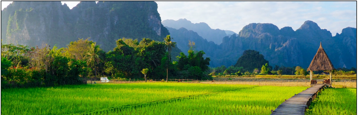
Northern Thailand is probably the most varied area in the Kingdom of Thailand