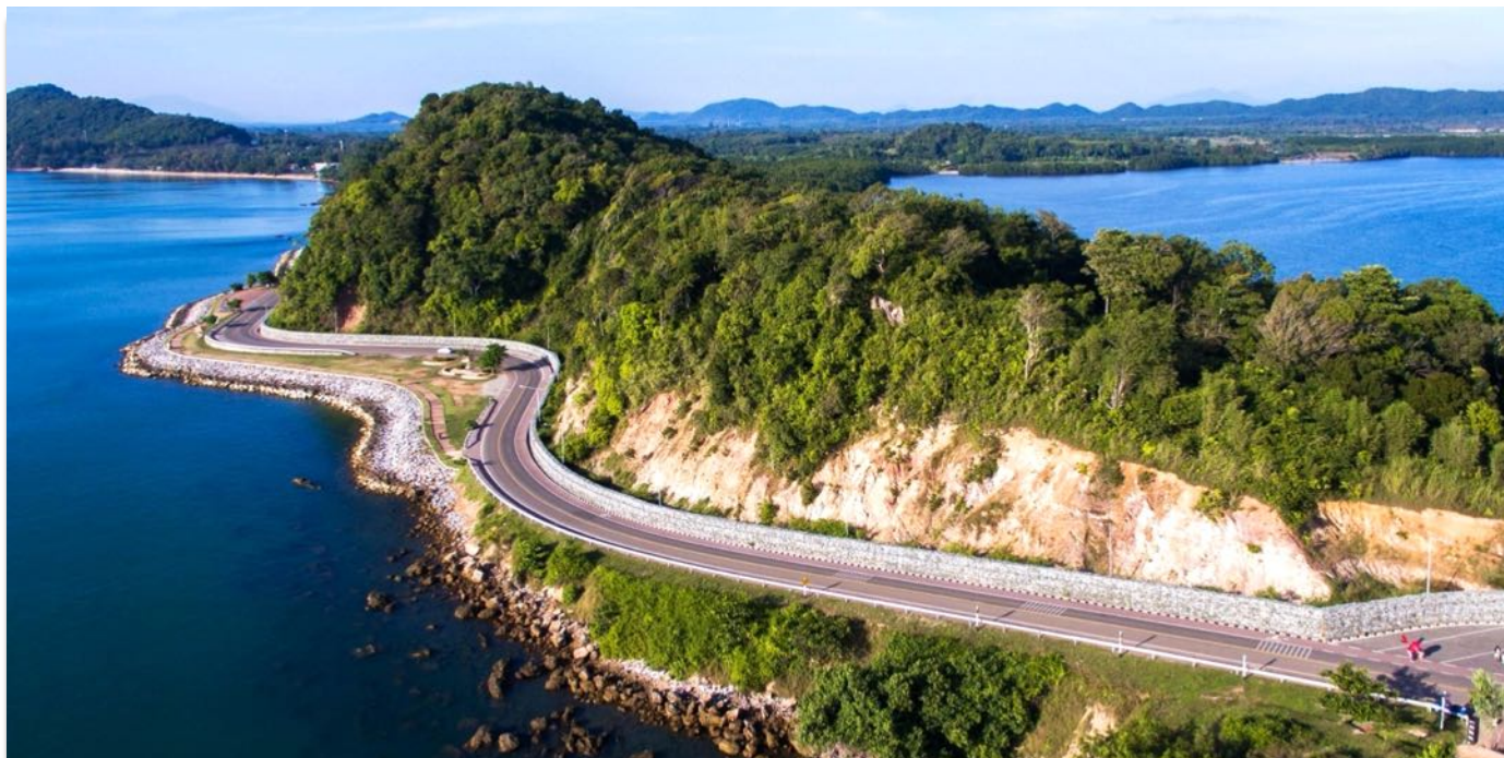
Noen Nang Phaya viewpoint in Chanthaburi province