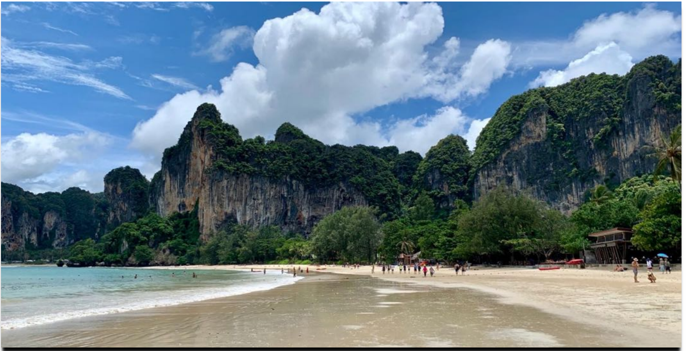
Railey Beach Krabi