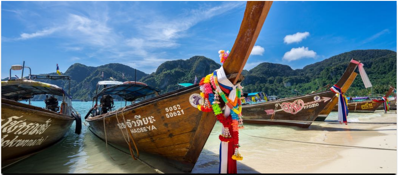
Krabi province provides countless beautiful dream beaches