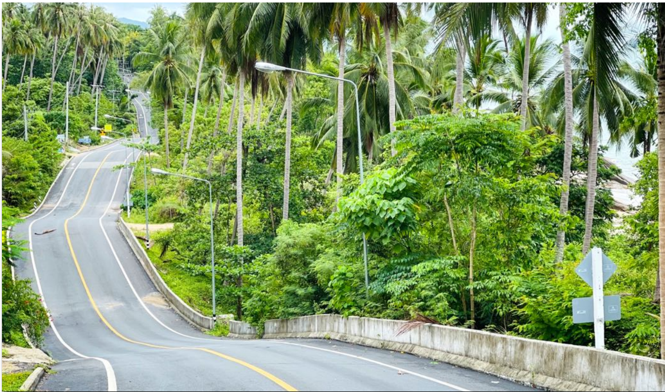
<Riviera of the South> Coastal road from Khanom to Sichon. Take a look on the rest day!