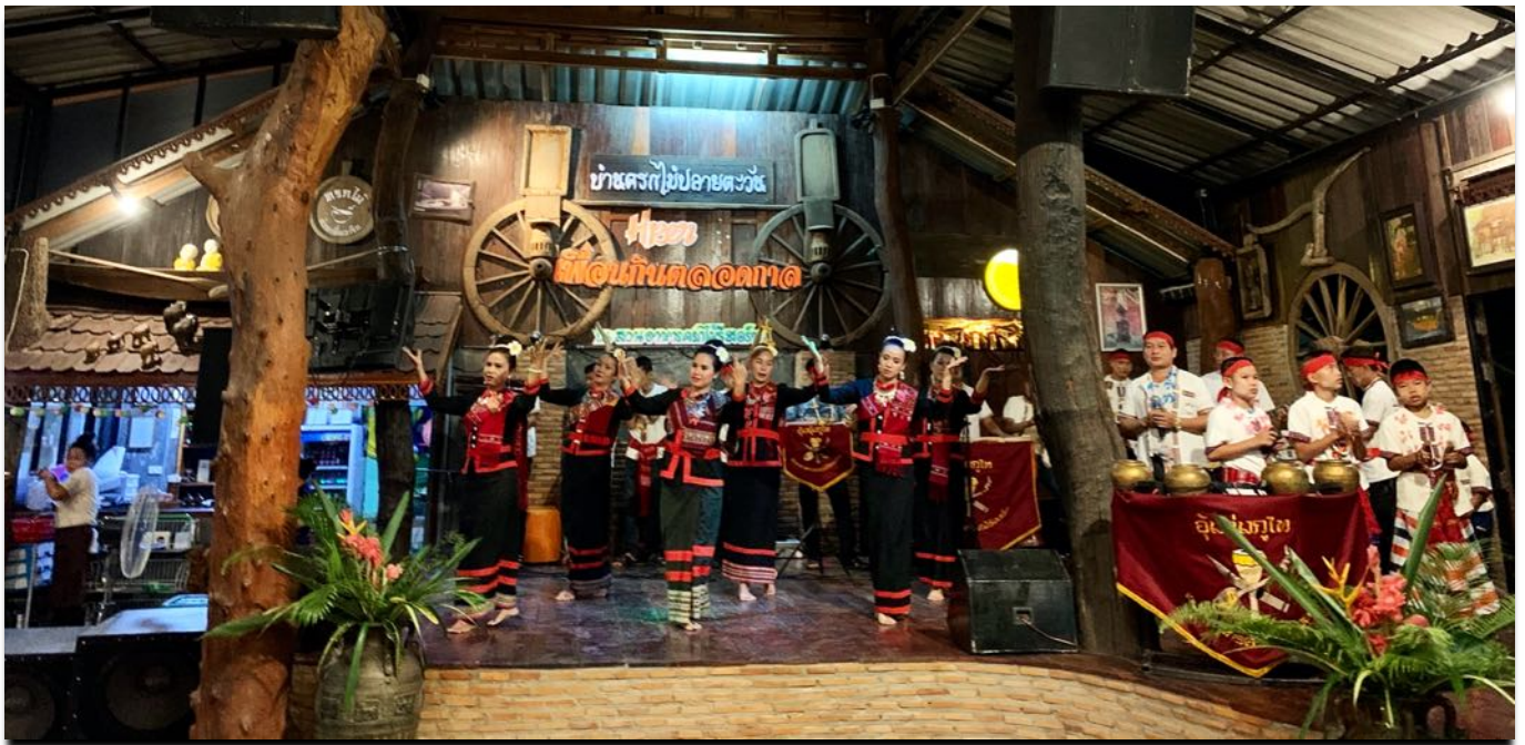
Meeting warm local people is always a pleasure