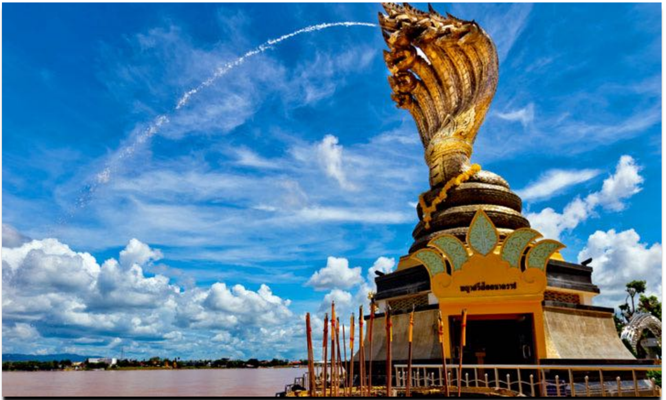
Passing many historical places and magnificent temples along the river