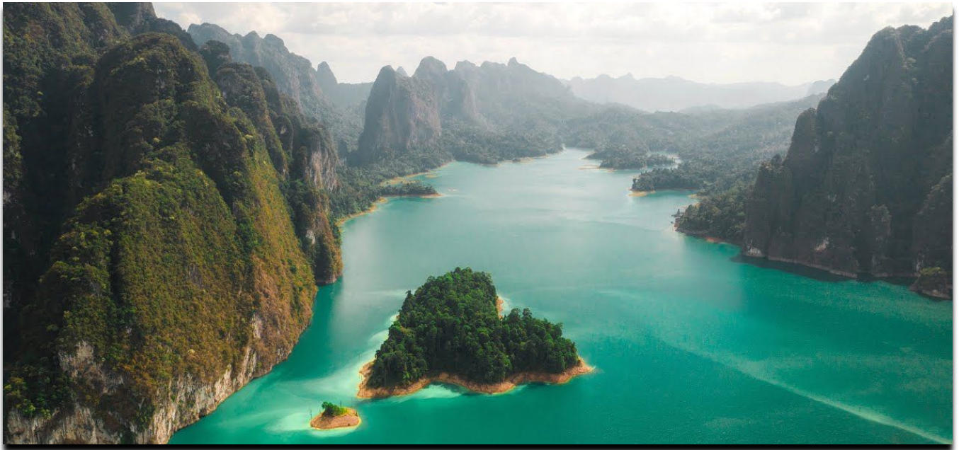
Impressive landscape of Khao Sok National Park – Chiew Larn Lake