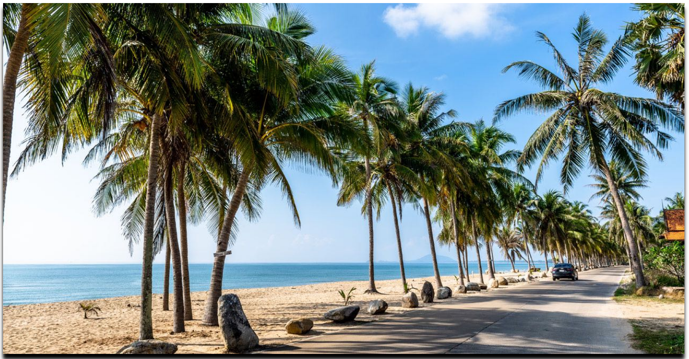
Ban Krut Beach – still an insider tip