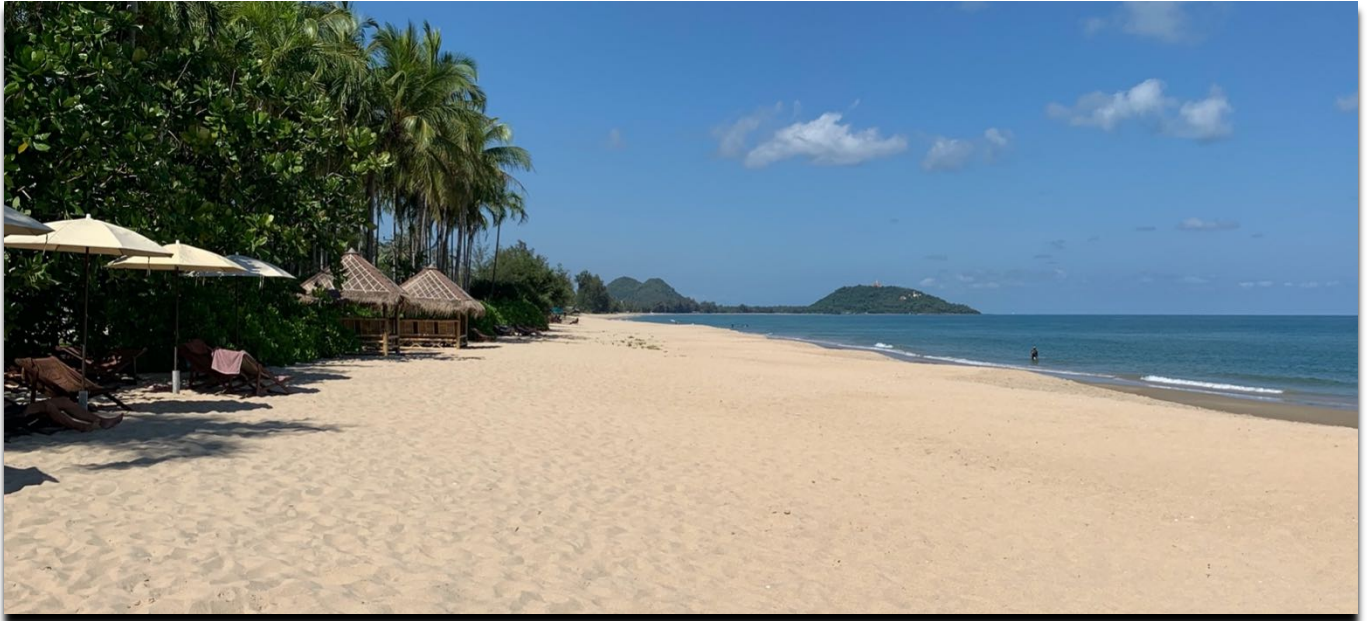
A dream beach for you alone