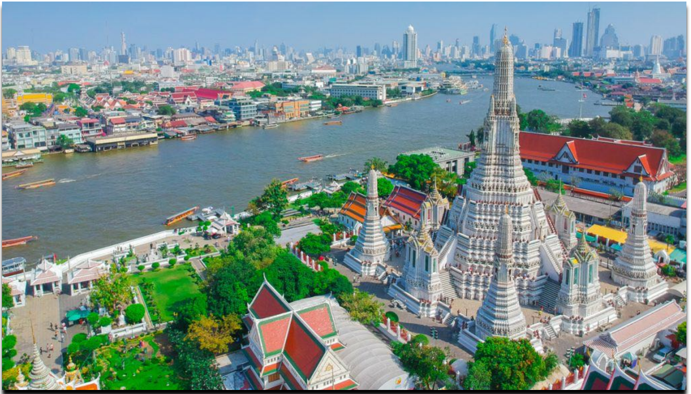
Bangkok: Chaopraya River with Wat Arun Temple